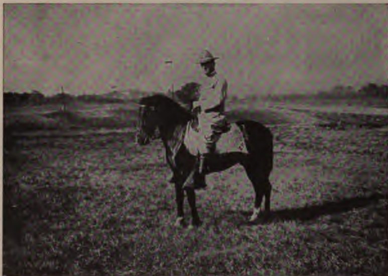
Off on Mounted Patrol